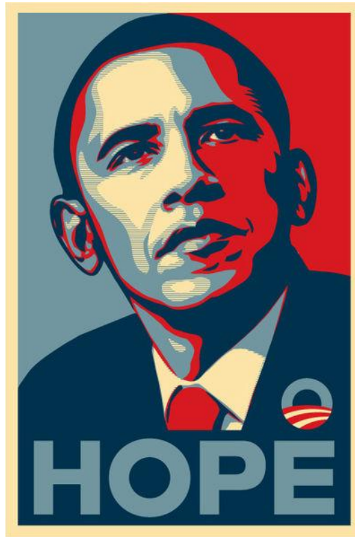
FIGURE 2: Barack Obama "Hope" Poster, (Originally by Shepard Fairey 2009).