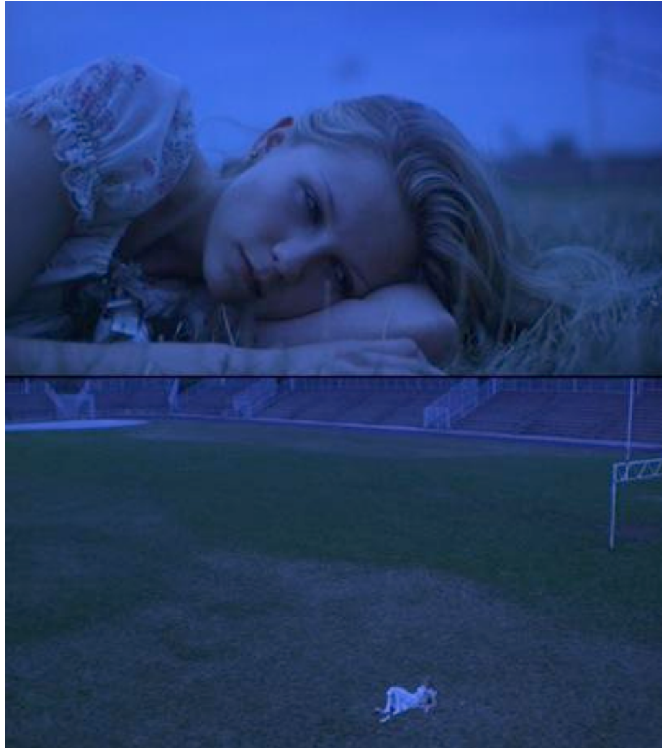
Figure 24: Still Image from The Virgin Suicides