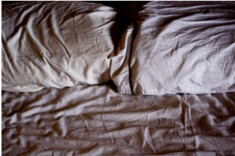
Figure 15: Untitled, The Bed as Object and Metaphor, Photograph by Author, 2011

Emphasis in my work has been placed on using natural light, texture, and color to create an image that brings together aesthetics and content, this is shown in figure 15.