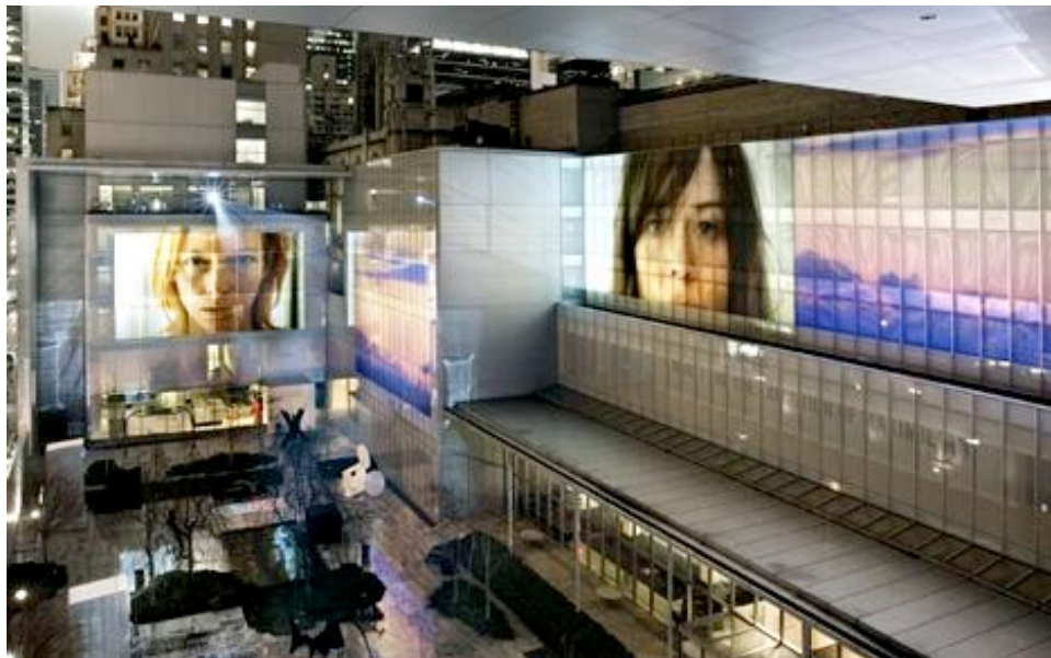
Figure 21: Installation view of Sleepwalkers by Doug Aitken, 2007

Doug Aitken made a video installation called “sleepwalkers” as seen in figure 21. This project was projected on the outside walls of the Museum of Modern Art in New York City. Aitken used five different people in this project, and made an installation that focused on the people as they sleep, wake up, and go about their day. The installation is interesting because it’s not one continuous video; the narration is broken apart with no real beginning or end, making it appear to be a series of moving images.