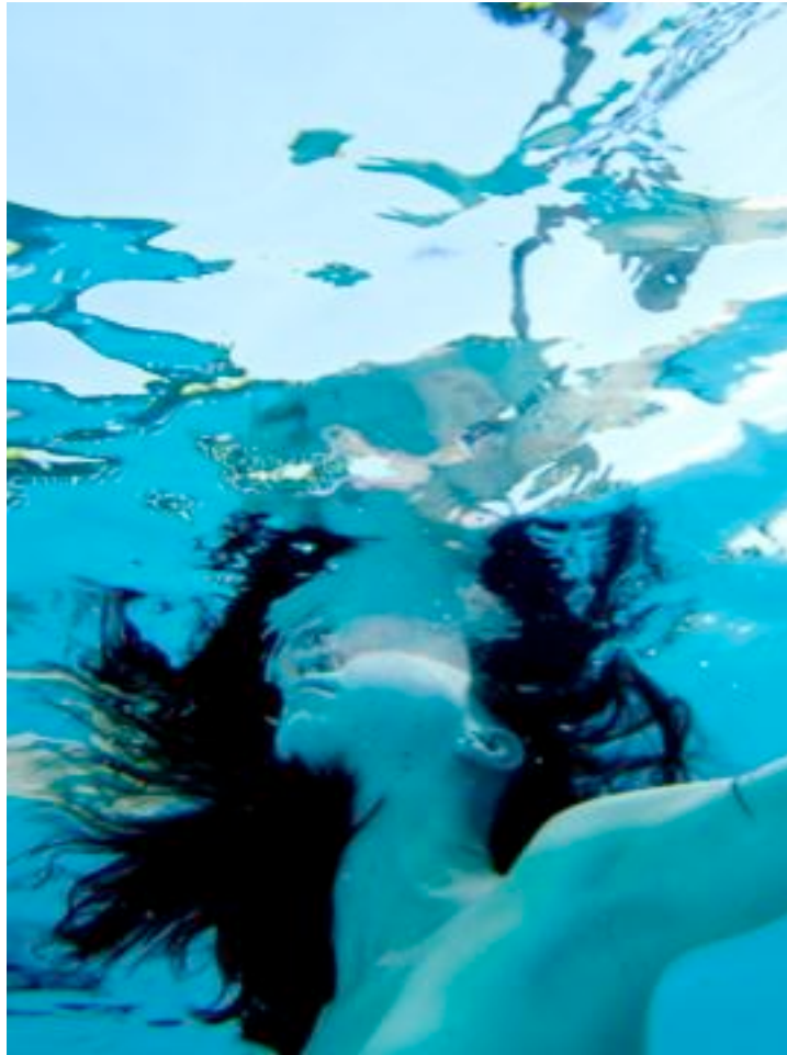
Figure 3: Untitled, Underwater Series, Photograph by Author, 2009

From that large body of underwater images, I moved on to a street style of photography, capturing melancholy and illusive moments in the world around me from the point of view of a voyeur, who was impeded by barriers which created a distorted reality of light and form. During this time, I photographed through windows from interior space, as seen in figure 4, and reflective surfaces as seen in figure 5.