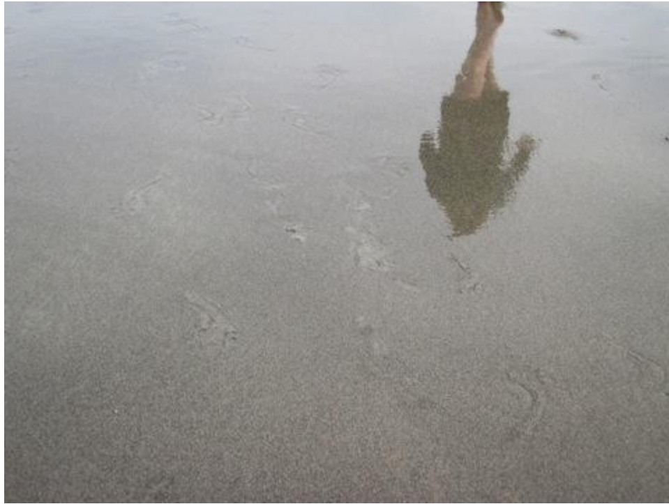
Figure 5: Untitled, Windows and Reflections Series, Photograph by Author, 2011

Now, I have explored and given deep thought to how my creative process works, what led me to create this new series, and how personal experiences inform this new body of work on the nature of the bed as object and metaphor.