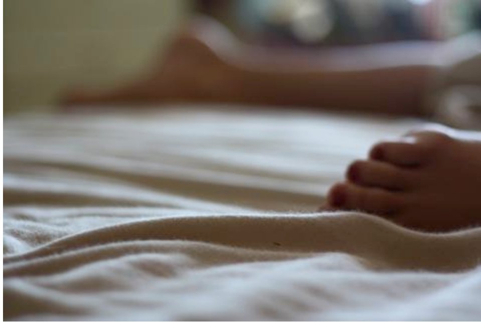
Figure 16: Untitled, The Bed as Object and Metaphor Series, Photograph by Author, 2012

Composition in my work is utilized by implementing very basic knowledge of design theory. Line is used to draw the eye to a specific spot where the subject of the photograph is. Color is used subtly, with warm hues to be inviting. Shape is used to create soft forms.