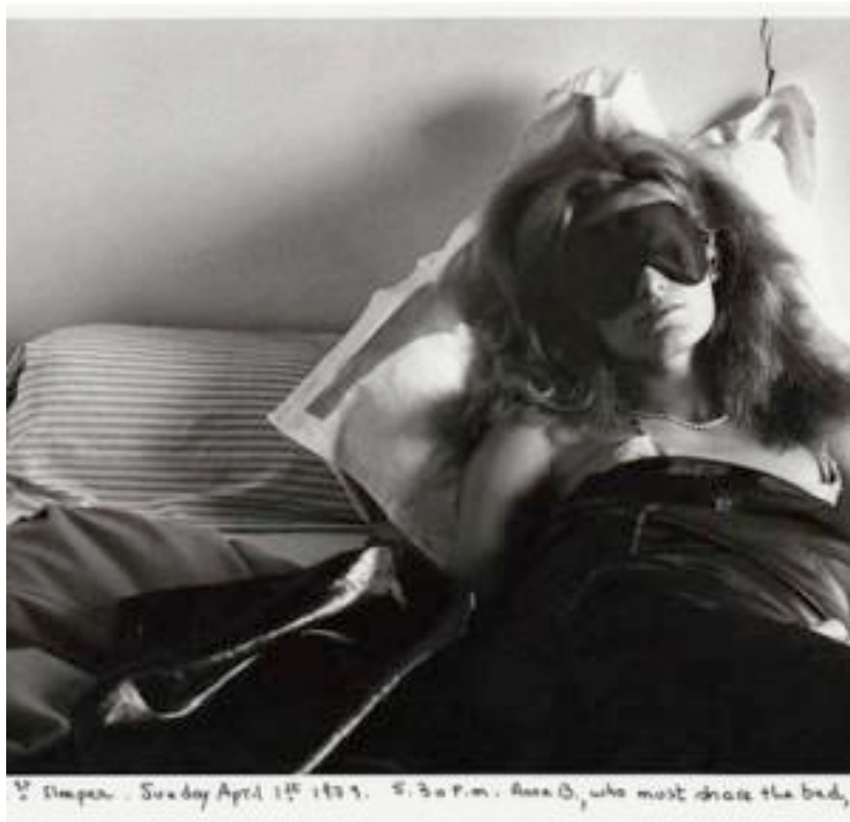
Figure 20: Gloria K - 1st Sleeper, Photograph by Sophie Calle, 1979

photographing them. Her style seems to be more documentary in the sense that she is being the voyeur, and attempting to capture these moods, feelings and vulnerable moments in other individuals, as seen in figure 20.