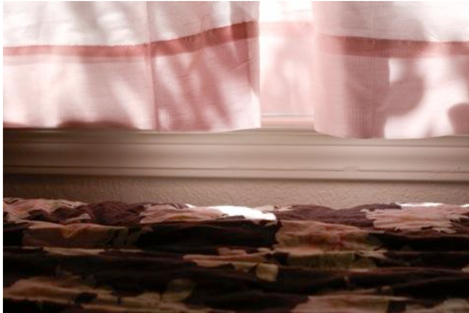
Figure 11: Untitled, The Bed as Object and Metaphor Series, Photograph by Author, 2011