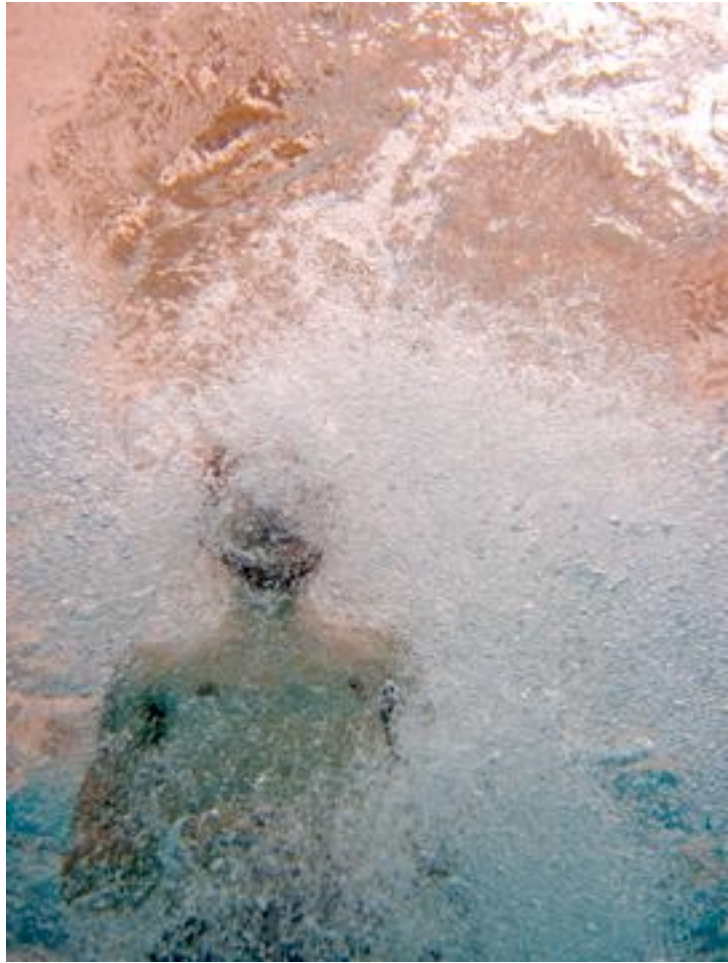
Figure 2: Untitled, Underwater Series, Photograph by Author, 2009