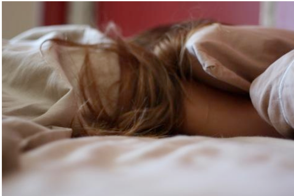
Figure 14: Untitled, The Bed as Object and Metaphor Series, Photograph by Author, 2011

In the images that show the figure completely turned away, as seen in figure 14, the same concept of disengagement and self-imposed alienation is present. The figure in the bed could be asleep or awake, but the act of being in the bed in the afternoon is still prominent.