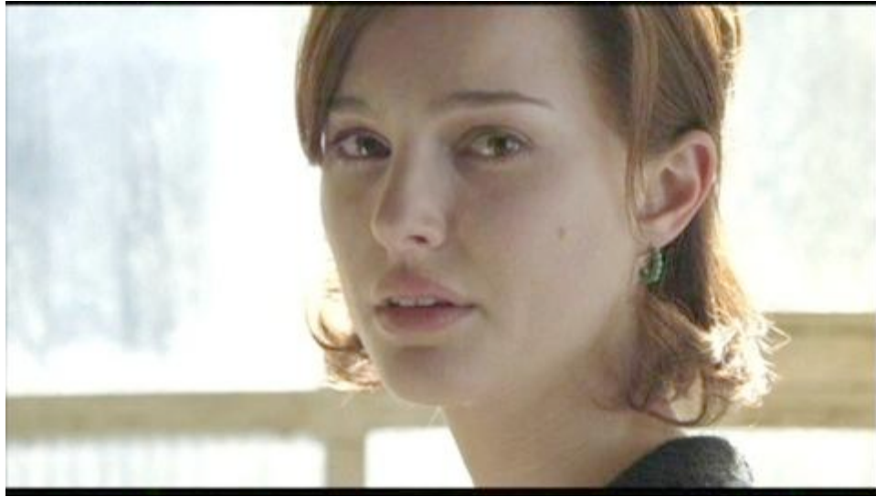
Figure 23: Still Image from Closer