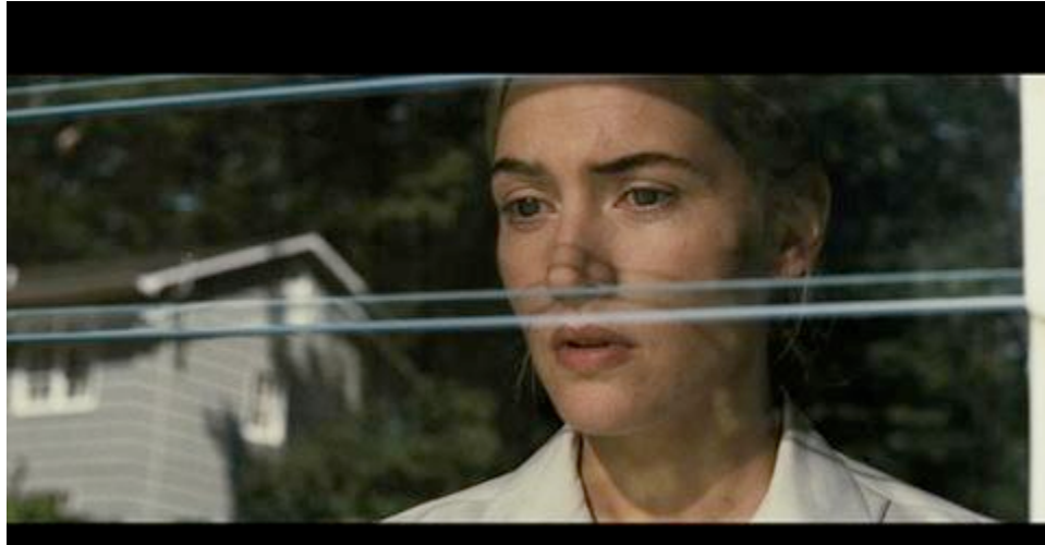
Figure 22: Still Image from Revolutionary Road