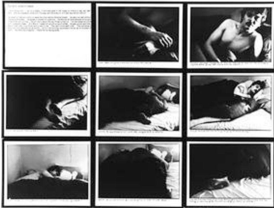
Figure 19: The Sleepers, Photograph by Sophie Calle, 1979

Sophie Calle’s work has always interested me because of the way she integrates her personal life into her art. I am attracted to how she explores human desire and alienation. Her project that I find most relatable to my series on the bed is called “The Sleepers”, as seen in figure 19. In this series Sophie Calle invited guests to stay in her bed for 8 hours at a time. Here she photographically documented the sleeping people as they laid awake, slept, and woke up. The end installation resulted in 173 photographs.