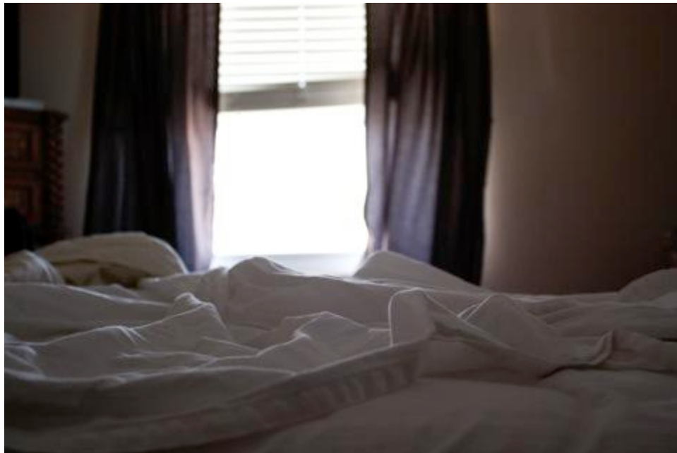
Figure 7: Untitled, The Bed as Object and Metaphor Series, Photograph by Author, 2011

on to photograph other people's personal spaces. In these images I focused on the bed, and the view from the bed. When I looked through these images there was something that struck me, a certain loneliness or emptiness, which can be perceived in figure 7.