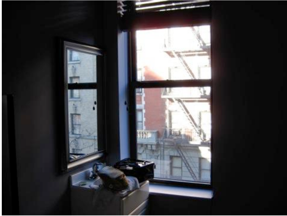
Figure 4: Untitled, Windows and Reflections Series, Photograph by Author, 2011