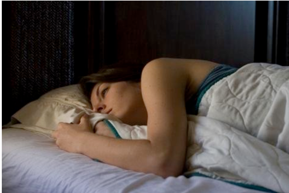
Figure 9: Untitled, The Bed as Object and Metaphor Series, Photograph by Author, 2012