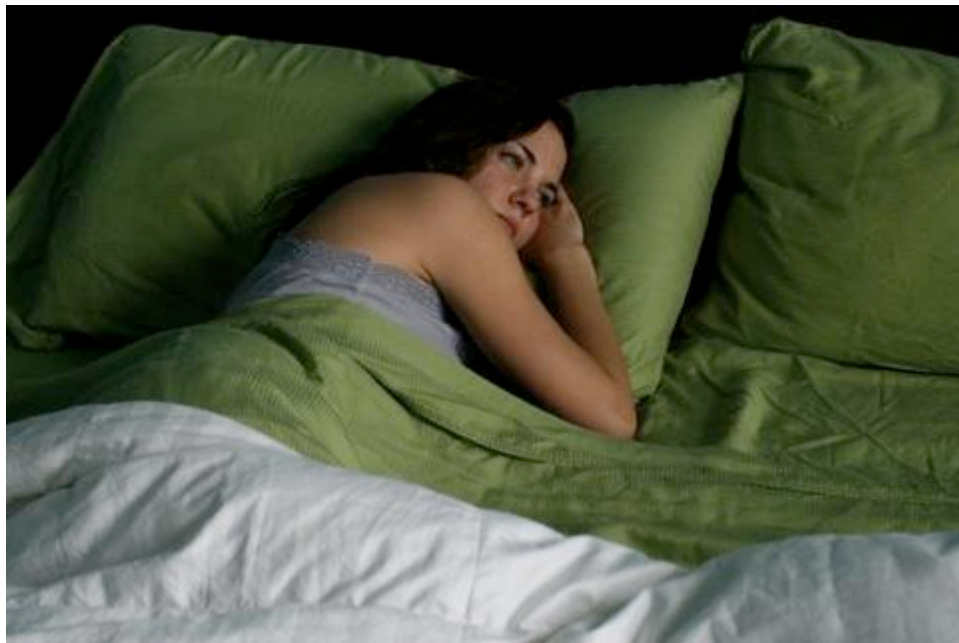
Figure 13: Untitled, The Bed as Object and Metaphor Series, Photograph by Author, 2012

Many of the images from this series are of women alone in their beds. I use women because I can relate to them, so the work is slightly representational. The work is not about the actual person I am photographing, but the portrayal of the bed as a place to experience inward thought, depression, and self-imposed alienation. These images that I am presenting of women alone in bed during the afternoon are essential to my concept. Certain images that show the female figure gazing outwards, represent and portray disengagement from the outside world. This concept is portrayed in figure 13. In this image the woman is looking outward, but confined to the bed.