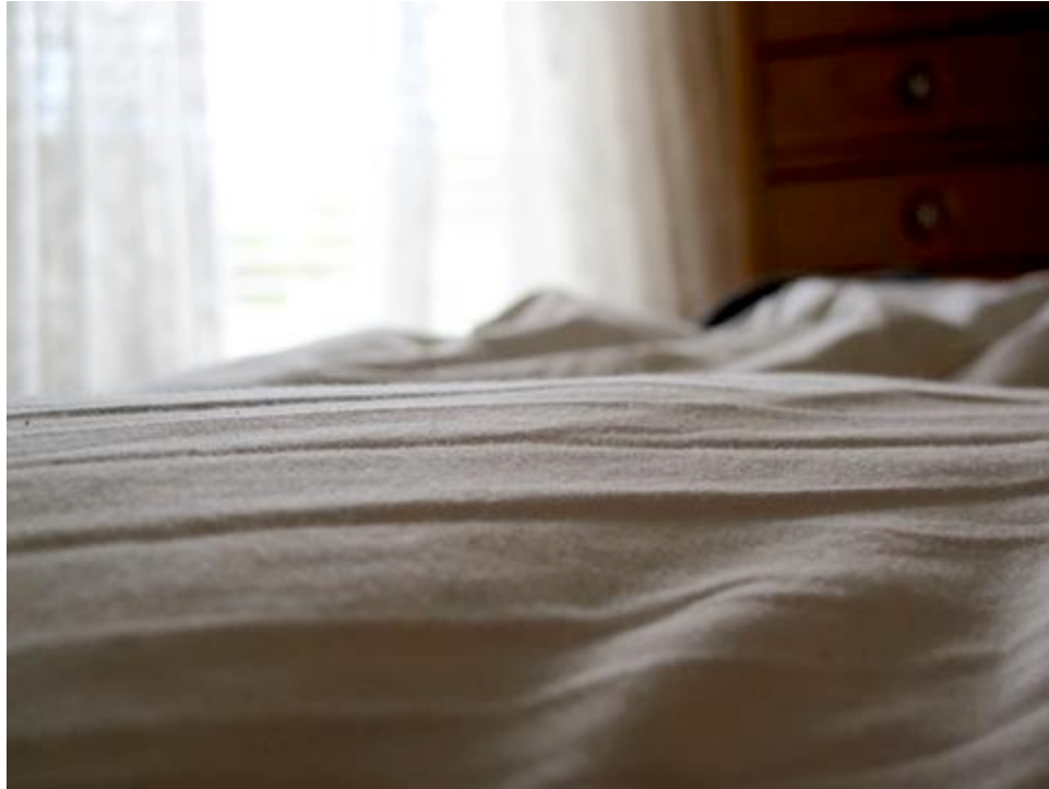
Figure 8: Untitled, The Bed as Object and Metaphor, Photograph by Author, 2011

The figure, specifically the female figure, was introduced into some of the photographs to push the concept further. When I proceeded to a shoot, I first photographed the bed from many angles throughout the room. Then, I photographed a female figure in the bed. It's important that the figure doesn't look contrived. The model is asked to find a position that is comfortable and she is asked to keep her eyes open. The model is then photographed with an emphasis on natural light flowing into the room from the exterior windows; as indicated in figure 9.