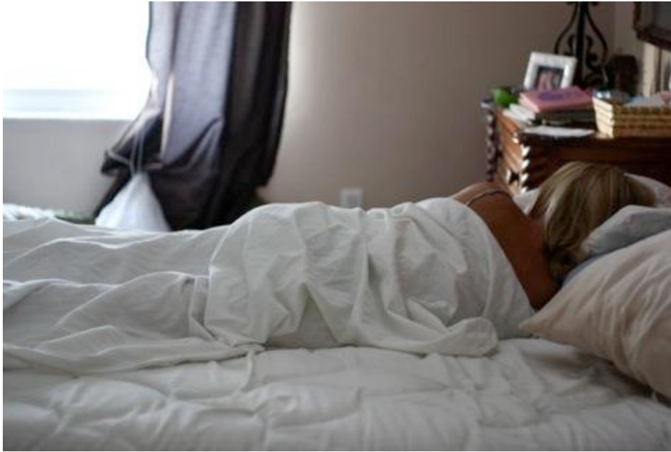
Figure 10: Untitled, The Bed as Object and Metaphor Series, Photograph by Author, 2012

All the images in this body of work are taken in the afternoon. This is the time of day that I find to be most depressing to be alone in bed. This concept is suggested in figure 10.