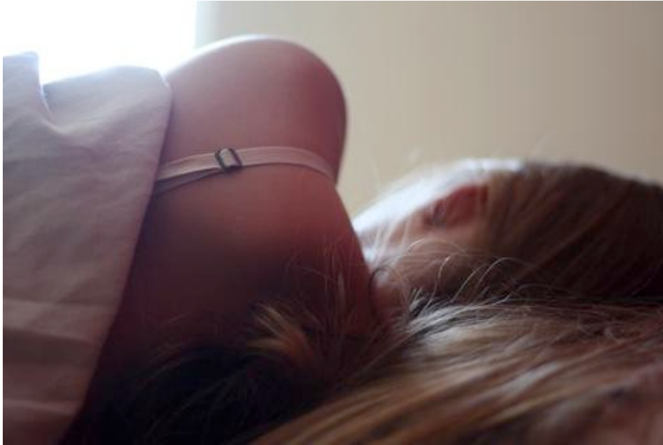
Figure 1: Untitled, The Bed as Object and Metaphor Series, Photo by Author, 2011

My photographic research has shifted focus to an intimate and personal series focusing on the bed; an example is seen in figure 1. Until recently, for the most part, I left my personal life out of my artistic practice, making images I felt were separate from it. My first series involved creating and distorting underwater figures, which represented my interest in a surreal world that questioned ideas of our perception. Figures 2 and 3 show an example of this underwater series.