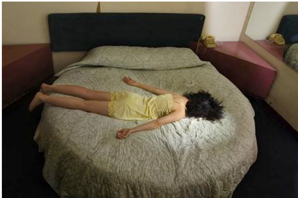
Figure 17: Photograph by Alison Brady