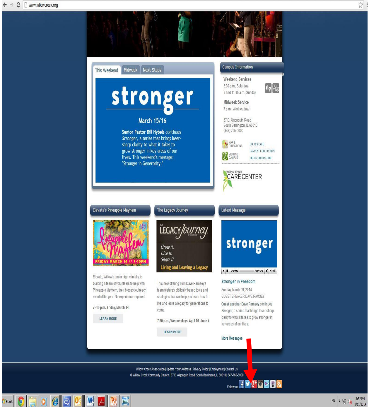
Figure 5-1: Willow Creek Church Website