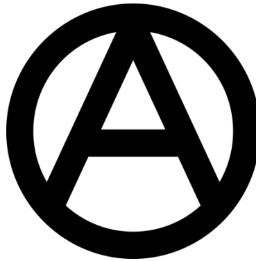
Figure 2: The “anarchist A” or “Circle-A,” another popular anarchist symbol.

resistance. One might also note that the symbol was adopted by the hardcore punk band Black Flag. It appears prominently in their shirts and on the cover art of their records—often alongside sensationalizing images such as a cop getting his head blown off or a nun spanking a child.