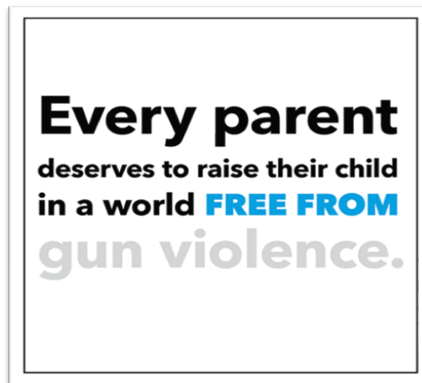
Figure 7. Every parent deserves to raise their child in a world free from gun violence (Planned Parenthood, Tumblr, 2018).

Local advocacy is unique for Planned Parenthood affiliates' use of Facebook and Twitter compared to the Planned Parenthood Tumblr pages, which they use as a broader source of education and outreach. Tumblr tends to appeal towards a younger demographic and is considered a safe space for LGBTQ+ communities and communities of color. These younger segments of the public influence how Planned Parenthood uses Tumblr to advocate for their patients and education, as the younger and more "open-minded" users allow Planned Parenthood to expand their advocacy techniques. Significantly, the values advocacy technique in promoting reproductive justice is especially prevalent in their Tumblr advocacy given the higher rates of people of color who use the site (see Figure 7).