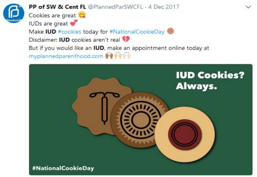
Figure 4. IUD Cookies and #NationalCookieDay, make an appointment today! (Planned Parenthood of Southwest and Central Florida, Twitter, 2017)

Both online advocacy attempts may appeal to users or potential patients for different reasons, but each fulfills an important role when considering how the 2016 election may impact Planned Parenthood. The retweet of an article examining the rise in IUDs is a reminder that even local Planned Parenthood affiliates are still political entities. By commenting on how women are becoming more demanding of access to birth control, they indirectly link the legislative fight that is about to come into play as Republicans attempt to repeal the Affordable Care Act. This is a subtle but important reminder that only political action will protect reproductive rights and access. The Facebook post takes an alternative route by referencing educational material in anticipation that more of Planned Parenthood patients may be seeking information about IUDs. However, both forms of social media use these platforms to not only educate supporters and respond to relevant political developments but also to inform them that they provide IUDs at the clinics (see Figure 4).