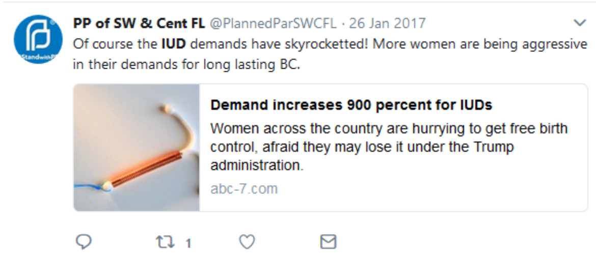
Figure 2. Retweet and comment “Demand increases 900 percent for IUDs” (Planned Parenthood of Southwest and Central Florida, Twitter, 2017)