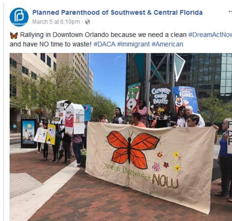
Figure 6. Rally in Downtown Orlando for DACA. (Planned Parenthood of Southwest and Central Florida, Twitter, 2018.)

process, and anything else that may target or impact low-income or marginalized communities. Twitter and Facebook are again used at the affiliate level to reach out with information regarding services they provide but also how political events may affect the clinic or patients' needs (see Figure 6).