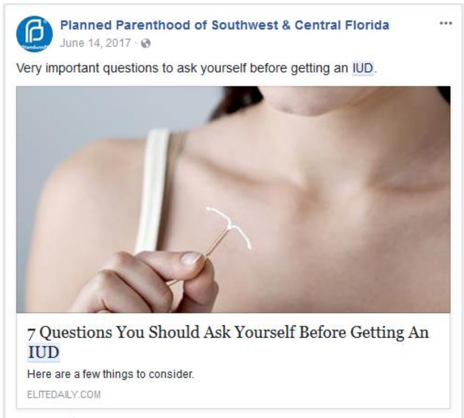
Figure 3. Facebook comment and sharing of educational article on IUDs (Planned Parenthood of Southwest and Central Florida, Facebook, 2017)