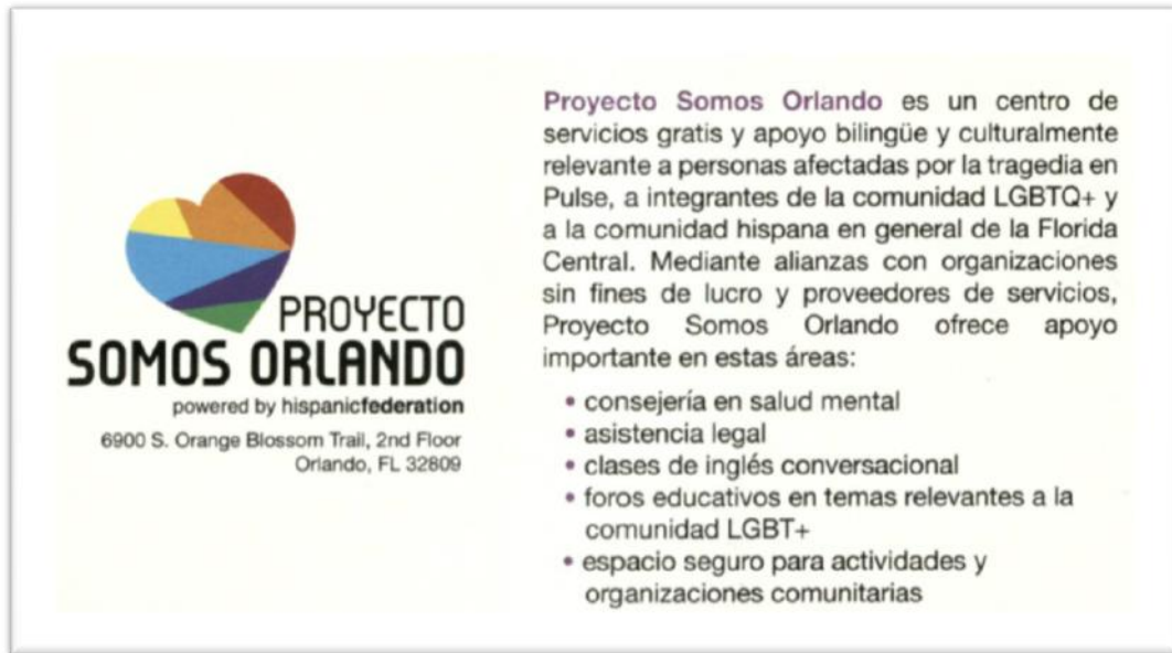
Figure 9. Proyecto Somos Orlando: List of services and aid provided to Orlando LGBTQ+ and Hispanic community (Hispanic Federation, 2017)

Both forms of literature were provided at a public event on a Planned Parenthood table during my Summer research, and both reveal the different organizations within the Central Florida region with whom the local Planned Parenthood affiliate has chosen to associate. This co-advocacy is the result of recognizing that Planned Parenthood may not be able to fulfill all the needs of the marginalized communities in Central Florida. The Proyecto Somos Orlando group is heavily affiliated with Planned Parenthood’s EOLA activism, and many of our meetings took place in the Hispanic Federation building, though this relationship has grown as a direct result of the Pulse nightclub shooting. Two Spirit Health Services provides resources to Orlando’s LGBTQ+ individuals who may be on disability or without health insurance, and the local Planned Parenthood clinics have been in association with them since 2012. Both relationships offer evidence of Planned Parenthood growing to understand diversity and providing inclusive medical services, particularly in the last few years. The growing relationships between service providers to marginalized communities in Central Florida are echoed in my interview with