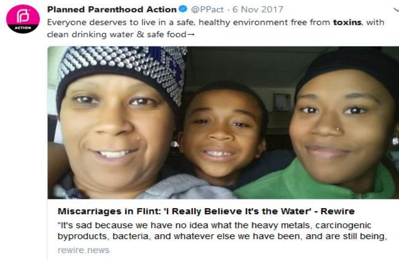
Figure 5. Miscarriages in Flint: Everyone deserves to live in a safe, healthy environment. (Planned Parenthood Action Fund, Twitter, 2017)

This same post was shared to the local affiliate Facebook and Twitter profiles and attempts to normalize conversations about IUDs with the fun idea of National Cookie Day, while also letting people know they can schedule an appointment for an IUD. Another notable aspect of this tweet is the use of emojis to convey a racially inclusive message. If Planned Parenthood is beginning to change the trajectory of their feminist identity, this transition would also need to be seen through their social media outreach. By using a values advocacy model (Brandhorst and Jennings 2016), my findings here show how social media posts form moral connections towards reproductive justice. These connections are usually evident in being more racially inclusive, discussing a diverse array of intersectional issues, and forming links between political activism and how to combat prejudiced institutions or policies. The following tweet for the Planned Parenthood Action Fund is an excellent example of the moral connections that Planned Parenthood attempts to make between its organization and the idea of reproductive justice (see Figure 5).