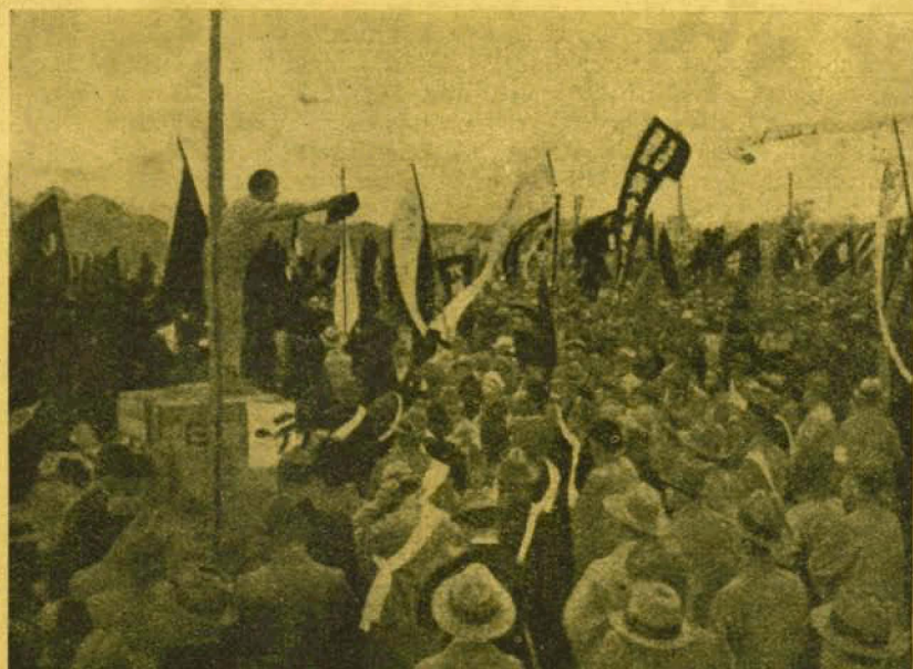
A Japanese anti-war meeting

This Memorandum was originally published in the COMMUNIST INTERNATIONAL the most informed world- wide workers' magazine Twice monthly . . . 10c.