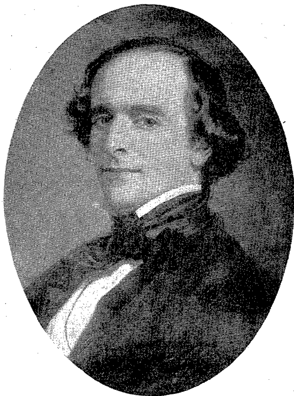
Hon. DAVID LEVY YULEE