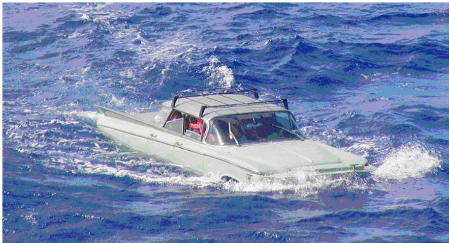
Figure 7: Cuban 1959 Buick raft.

F.Supp.2d 1242 (S.D. Fla. 2004). In Rodrigues , eleven Cubans were caught at sea trying to travel to the United States in a raft fashioned from a 1959 Buick on February 3, 2004. The Cuban immigrants were found twenty five miles south of Marathon, Florida in international waters. While onboard the Coast Guard vessel, the Cuban immigrants entered within twelve miles of the Florida coast on three separate occasions. On February 10, 2004 an Asylum Officer interviewed the eleven Cubans to evaluate if they showed a sufficient amount of fear in order to be granted asylum. Of the eleven immigrants, eight were sent back to Cuba and the other three were found to have shown a believable fear of persecution and were taken to Guantanamo Bay. Rodrigues argued to consider entry into United States waters sufficient for immigration purposes. The District Court held that entry into United States waters did not count as entry into the United States for immigration purposes.