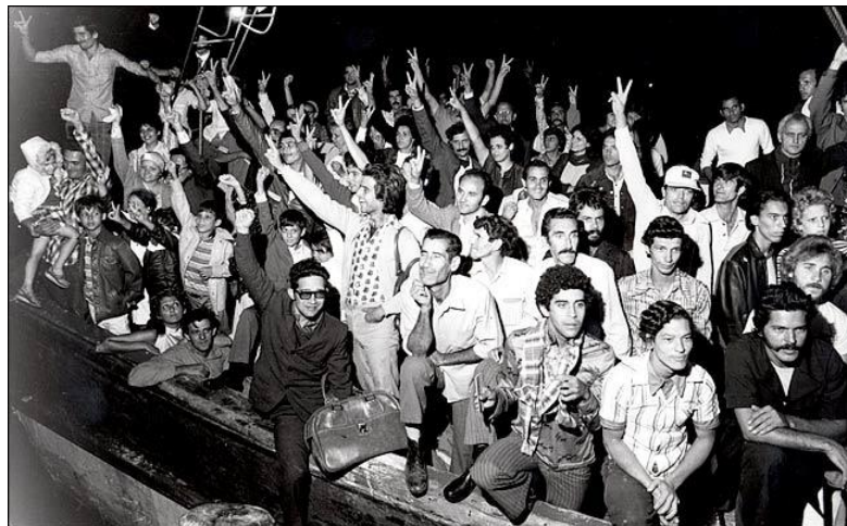
Figure 4: Photo illustrating refugees arriving in the US via the Mariel Boatlift. Printed in the New York Times.

“The Communist Party of Cuba stated clearly that Cuba wouldn’t oppose those who wanted to go to the United States, and they could do so directly and safely, in boats sent by their relatives to the ports of Mariel (García 218-219).”