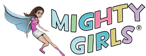
MG Logo designed by E2i Studios, UCF Institute for Simulation and Training