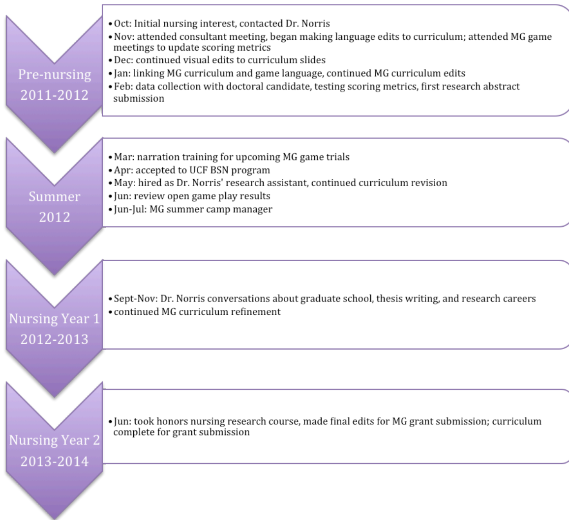
Figure 1: Timeline for Research Experience