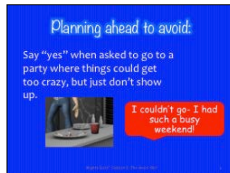
MG Content Slide for Session 3