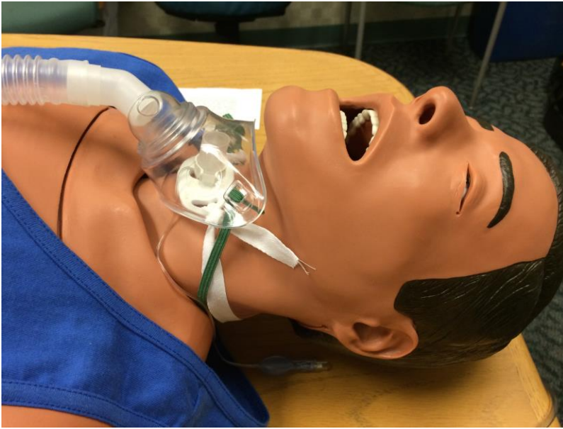
Figure 1. Low cost model anterior view