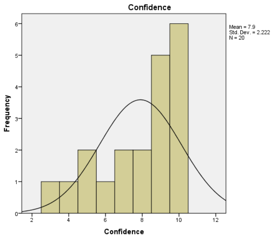
Figure 2: Confidence Question Responses

One question regarding the confidence of tracheostomy care delivery was presented to the participants prior to the delivery of care. Participants were asked to rate their overall confidence at performing tracheostomy care on a scale of 1 to 10. 1 indicating “not at all confident” and 10 indicating “most confident.” The lowest score reported was a 3 (n = 1), and the highest score reported was a 10 (n = 6). The mean confidence rating was 7.90.