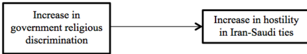
Figure 2: Positive relationship between increase in governmental religious discrimination and the increase in Iran-Saudi hostility