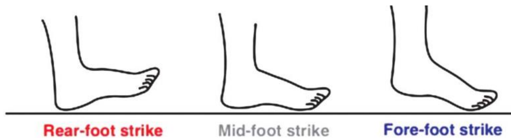
Figure 7 Different Footstrike Patterns

2014). Some factors related to these differences include “kinematics, changes in ground reaction forces, loading, joint movements and power, joint range of motion, muscle activation patterns, and running economy (Rothschild, 2012). When analyzing footstrike pattern, another consideration are the fundamental components of stride length and stride frequency (Hollander et al., 2015). It has been demonstrated that a runner changing their strike pattern to a forefoot strike, lowers the impact and decreases the runner’s stride length while stride frequency increases (Hollander et al., 2015; Perkins et al., 2014).