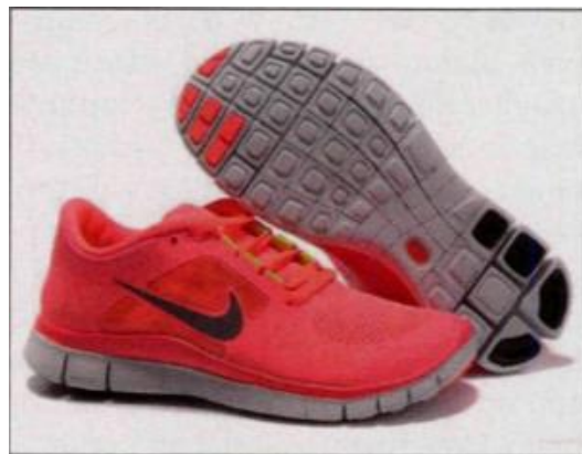
Figure 4 Nike Free

The next shoe to consider is the Nike Free. Because Nike is one of the largest athletic footwear manufacturers in the world, it is inevitable that they would cater to the minimalist shoe trend (Cortese, 2009). It has been suggested that Nike Inc. has been “credited with inventing the running shoe as we know it today” (Boudway, 2011; Holsomback & Peak, 2012; Leung, 2009; McCartan, 2013). It could also be argued that Nike had predicted the minimalist running trend and initiated the popularity of the movement with the release of their Nike Free in early 2004 (Boudway, 2011; Holsomback & Peak, 2012; Leung, 2009; McCartan, 2013). Because of its rather early