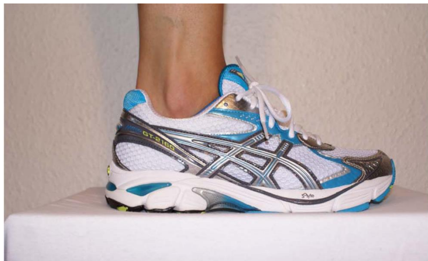
Figure 6 Asics GT-2160 (Traditional shod running shoe)

The next category of footwear to consider is the traditional shod shoe when analyzing the amount of support in a shoe. “Shod” running may be defined as running in traditional, modern running shoe, with a thick heel and adequate support (Holsomback & Peak, 2012; McCartan, 2013). Originally created and popularized in the 1970s, conventional running shoes were designed with the intent to prevent chronic