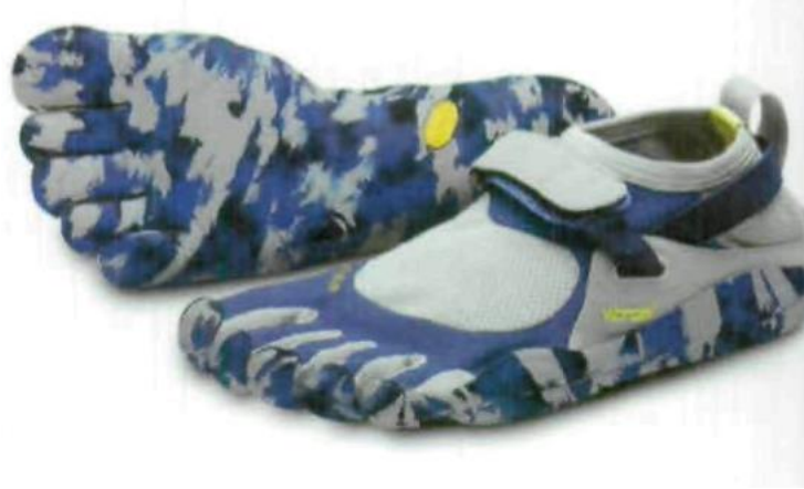
Figure 3 Vibram Five-Fingers

Another type of minimalist footwear is the “Five-Fingers” or “toe-shoes” made originally by the footwear company Vibram. Vibram, an Italian shoe company, first launched its Five-Fingers shoe in 2006 at the famous Boston Marathon. They named the shoe Bikila , after the previously noted, world record-holding marathoner, Abebe Bikila (Alsever, 2012; Boudway, 2011; Johnston, 2011; Ryan, 2012). Five-Fingers were described as a “cross between a sandal and a glove for feet, with individual slots for each toe” (Alsever, 2012; Leung, 2009; Smith et al., 2015). This unique design, originally acquired from a design student, bridged the gap between running in shoes and running barefoot (Alsever, 2012; Leung, 2009; Smith et al., 2015). When the Five-Finger shoe was developed, Vibram’s chief executive officer revealed to their “biggest sole customers” to ask if they would like to form a partnership on the product. The customers declined the partnership offer. They reasoned that the Five-Finger design was “a little too strange” (Boudway, 2011). Vibram’s own website defined the Five-