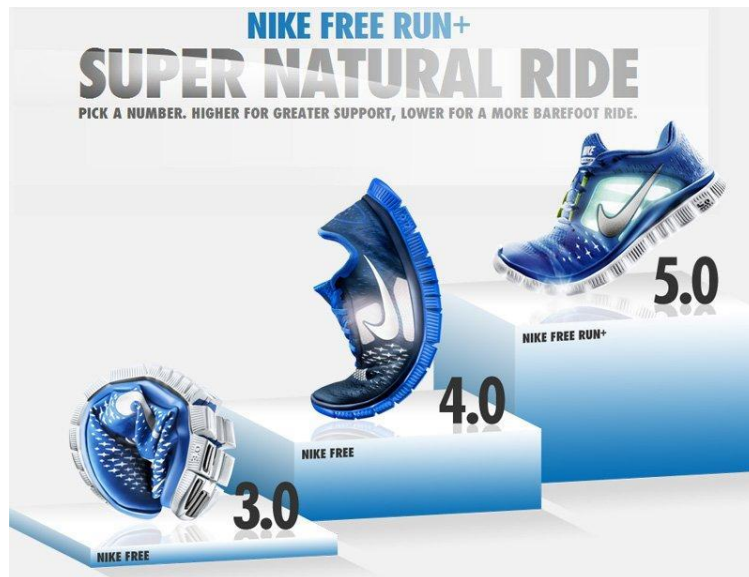
Figure 5 Nike Free Options

The original design of the Nike Free shoe was inspired by a respected track and field coach, Vin Lavanna, of Stanford University who incorporated barefoot running into the team's training (Cortese, 2009; Pearl, 2009, 2011). After seeing the cross-training of collegiate athletes incorporating both shod and barefoot running, researchers conduct a study with students using the newly designed Nike Free (McCartan, 2013; Pearl, 2009). It had been developed that after six months of integrating the Nike Free into their training routine, the athletes had "greater flexibility and strength in the foot" (McCartan, 2013; Pearl, 2009). The Nike Free was originally designed to "mimic the kinematics of barefoot running" (Nigg, 2009; Pearl, 2011). Although, it had been suggested that the wide heel and flexible forefoot design was intended to "force the foot to be more active than in a conventional shoe" (Nigg, 2009). From this research, the Nike Free was designed as a cross-training shoe, making it an appropriate choice for all