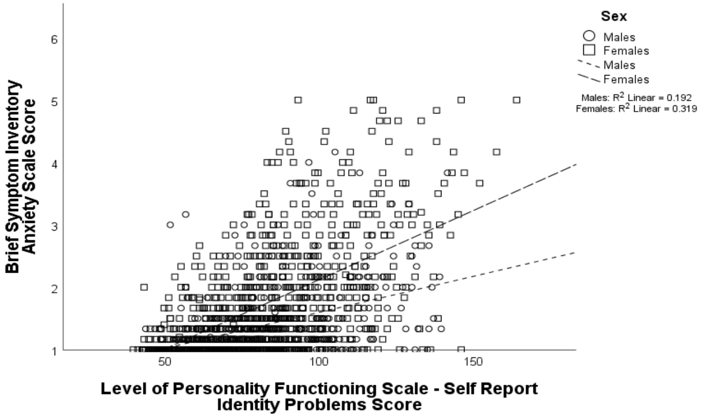
Figure 1: The simple effects of the significant interaction of sex x LPFS Identity problems and BSI Anxiety