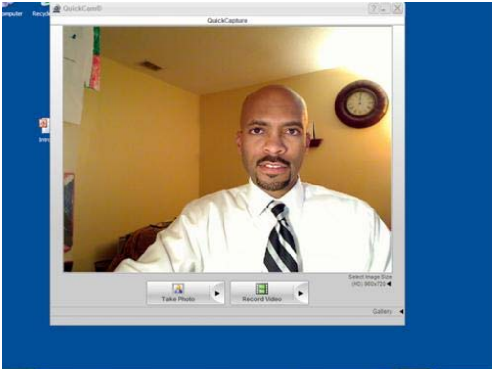
Figure 4. Video Chat

The website also featured live interactive dialog (See Figure 4) between the researcher and the participant via the use of a web camera. The video chats allowed the participants to openly discuss issues related to their lives in general. A summary of the web development process appears in Table 4.