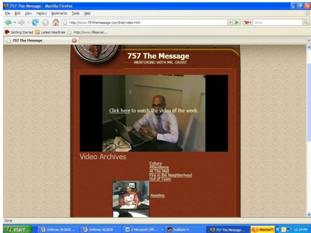
Figure 2. Video Clip Example

The video clips, a sample of which is displayed in Figure 2, were created by the researcher (a Black male role model) and discussed attendance, behavior, and achievement.