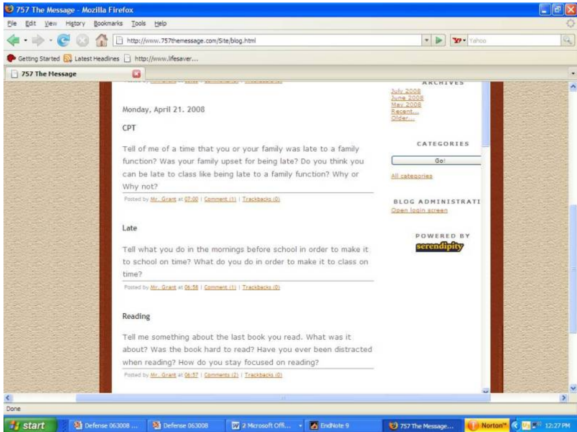
Figure 3. Participant Blog

The website contained a blog space (See Figure 3) where the researcher posted a weekly question based on the video clip scenario. The intended purpose of the blog was to facilitate group mentoring sessions between the participants and the researcher.