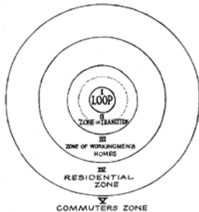
Figure 2. Park & Burgess' Model

for years following World War II, it has more recently been used to explain modern day urban life.