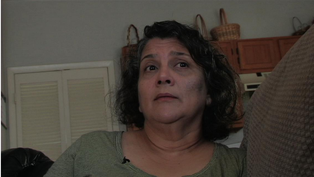
Figure 2: My mother explains the "death of a dream."