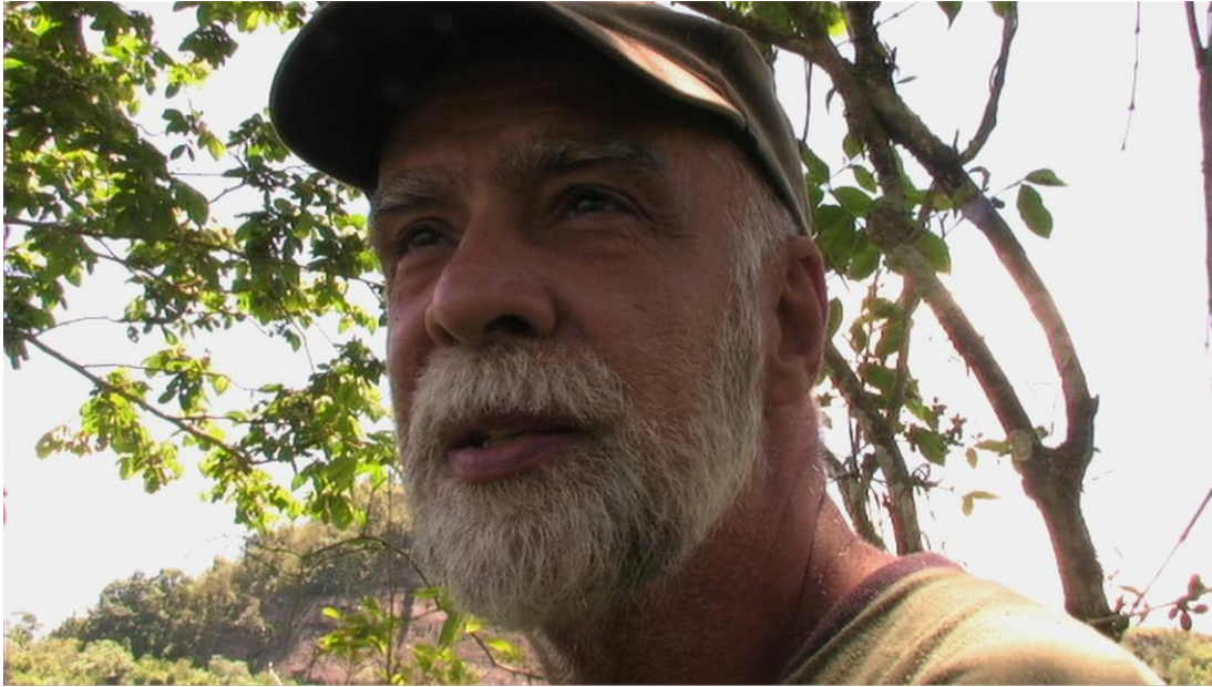
Figure 1: My father draws parallels between my childhood and his.