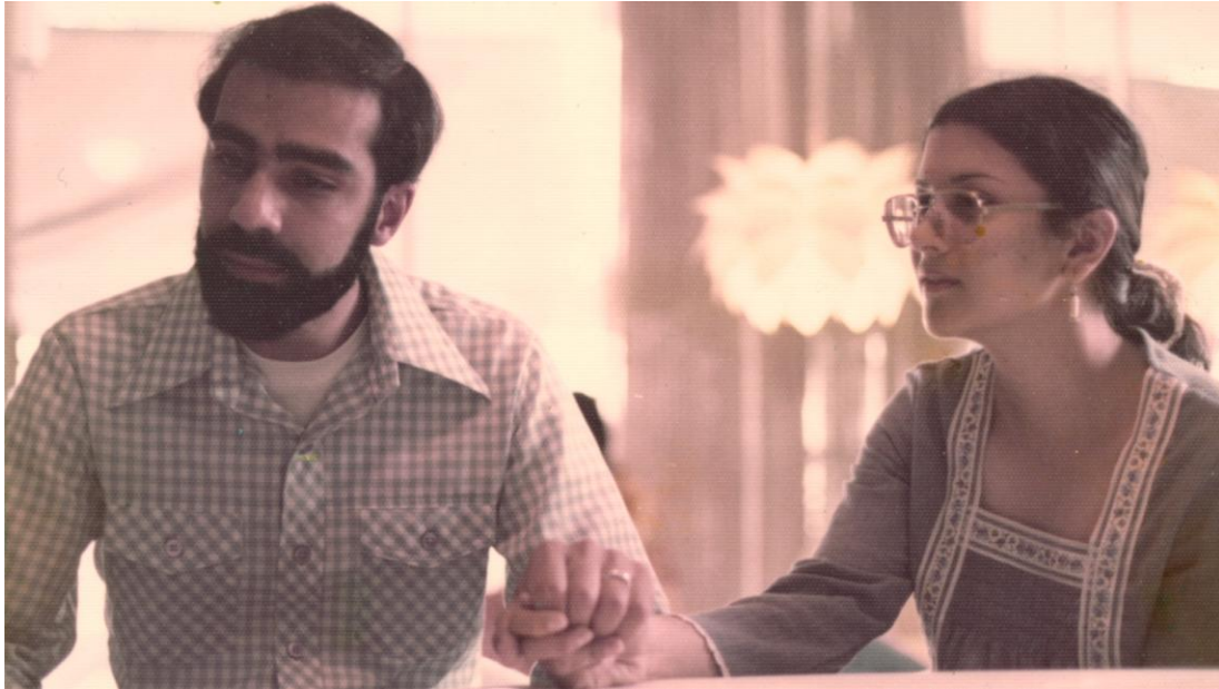
Figure 3: My mother and father at their wedding.