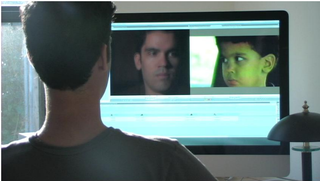
Figure 8: My obsession with my past, as part of the prologue of the film.