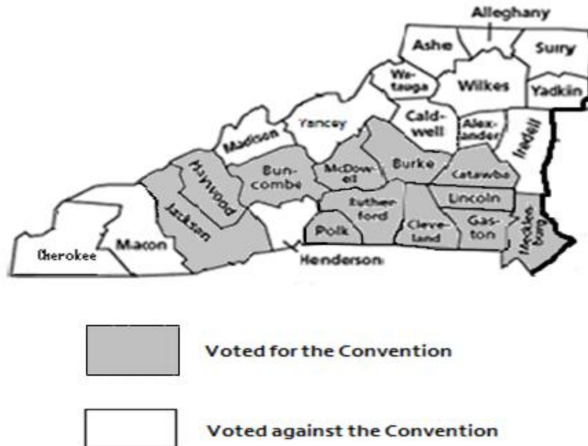
Figure 3: Convention vote in Western North Carolina.

Secessionists in the state house and senate hoped that the election of Lincoln would bolster secessionist sentiments in the state. In hopes of this surge, they prepared a bill calling for North Carolina to vote on whether to call a secession convention. The bill stipulated that North Carolinians would vote on February 28, to decide whether to have a convention. The results of the convention vote reveals how deeply divided North Carolina had become in the spring of 1861. The surge in secessionist enthusiasm hoped for was not enough to pass the convention bill. Although secessionists won forty-seven of the eighty-two North Carolina counties, they narrowly lost the popular vote. In total, 94,009 North Carolinians cast ballots, of which 47,338 (fifty-one percent) voted against the bill. Unionists won the vote by a narrow 667 votes. In Western North