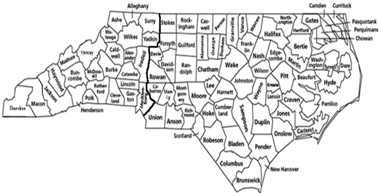
Figure 1: North Carolina County Map

Appalachia during the Civil War is revealing of how citizens and soldiers struggled to maintain their national identity while preserving their communities and homes. 8