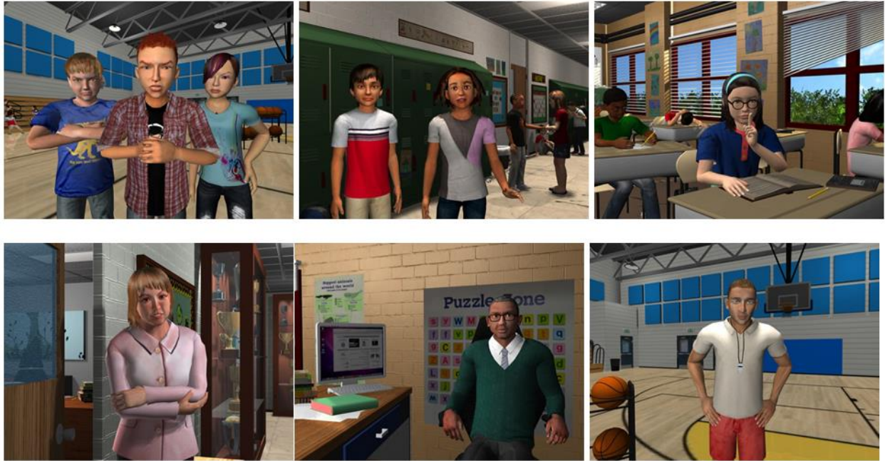
Note: Top Row (Left to Right) School Bully, Popular Classmate, Smart Classmate; Bottom Row (Left to Right) School Principal, Classroom Teacher, Gym Teacher