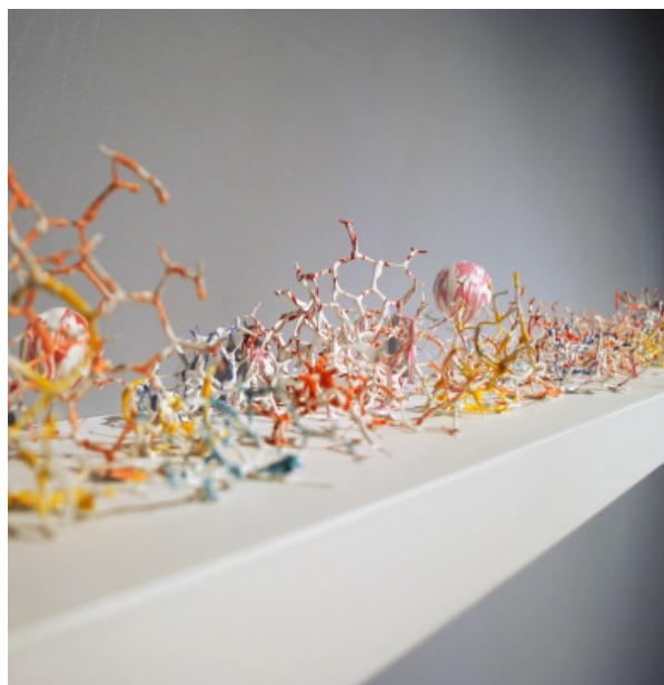
Figure 4: MicroDoodles (image by Stephanie Cafcules)

Taking a year off before entering into the Studio Art and the Computer MFA degree program, I was even more determined and enthusiastic about exploring processes and mediums.