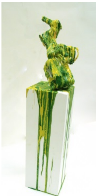
Figure 3: Green and Yellow (image by Stephanie Cafcules)