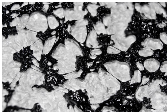
Figure 7: untitled (detail of polystyrene)

Polystyrene has become a staple for my large scale sculptures and models; it is used widely throughout the world in construction industry due these attributes; however, I discovered that this material could be of use to me in my ongoing quest for texture. I tend to work on several pieces and with different processes simultaneously; this keeps my mind busy and my work progressing positively even if I find myself at a stand-still with a single idea or material. In response to my effort to add texture to my pour series, I noticed a large piece of discarded polystyrene in the studio. I knew spray paint melts this material and therefore, it would be my chosen method to create the texture I was looking for. After briefly working with this material, I knew I had discovered another process to explore: the black spray paint had nibbled at the polystyrene but not to my satisfaction. I threw some acetone on it and soon got a violent and beautiful reaction. This chemical easily disintegrates polystyrene while the black spray paint acts like glue creating a spider web of black tar--almost as if holding the white foam together even as it melted away. This reaction resulted in the beautiful texture seen in Figures 7 and 8.