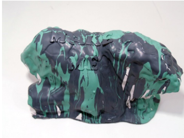
Figure 2: Make Me

I lived in the sculpture studio at UCF for the latter part of my undergraduate degree. Pouring, dripping, and splattering paint like that of my biggest influence, Pollock, I was trying to find my niche among processes and art that had been done long before I was born. I pursued welding, plaster, wire, paint, and a combination of materials to see where I might fit. I made a lot of bad art, and still do; however, all the bad art had to be to promote the evolution of my technique and concept for the evolution of my technique which can be seen in Figures 2 - 4. That finally came toward the end of my undergraduate degree when my MicroDoodle series was born.