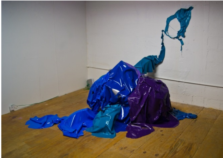
Figure 6: untitled (image by Stephanie Cafcules)

In the example seen in Figure 6, I chose a cool color pallet. The saturated, glossy colors are intense and reflective contrasting with calming effects of a cool color pallet. The strong directional force of the piece creates movement taking on a creature-like quality. Ambiguity, texture, color, reflectiveness, and opposing forces both synthetic and natural create a new identity for this amorphic form.