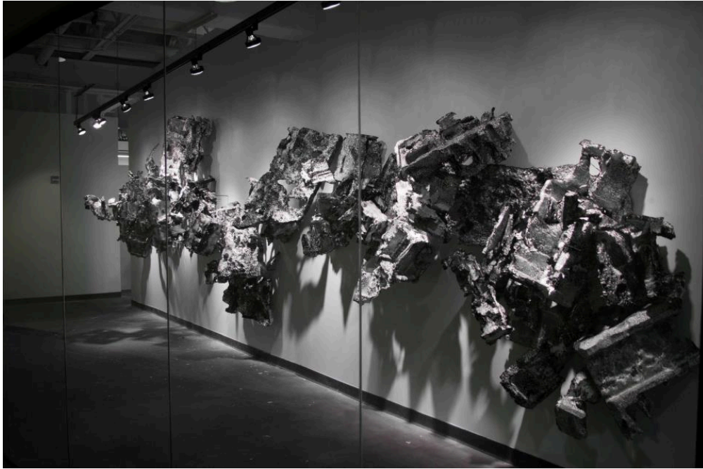
Figure 9: untitled (site specific installation) (image by Stephanie Cafcules)

polystyrene look like concrete. Charred remains and faux space rocks contribute to a cascading series of viewer responses.