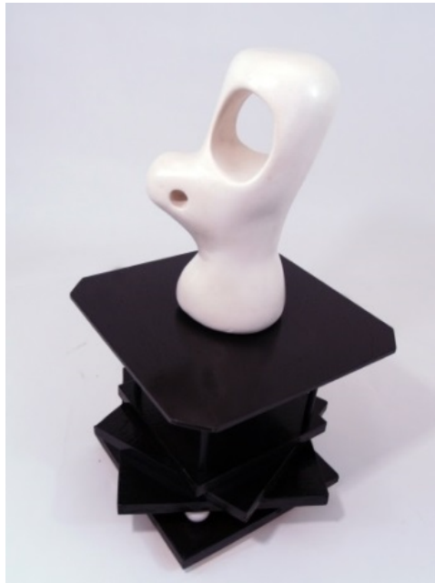
Figure 1: Beginning

My art journey began in the midst of taking a three-dimensional design class in the fall of 2005; I was 23 years old. Previous endeavors in computer science were unsuccessful (my heart was not into it). My enthusiasm for coding and severe attention to detail dwindled quickly; I was looking for something inspiring and challenging. With the creation of my first non-representational sculpture carved out of plaster as seen in Figure 1, studies in three-dimensional design ignited my curiosity and became a turning point. I discovered what I wanted to do: make art. Working with my hands and creating pieces using various mediums such as wire, plaster, and cardboard sealed my fate of becoming a sculptor and installation artist.