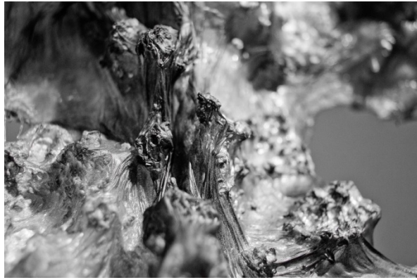
Figure 8: untitled (detail of polystyrene) (image by Stephanie Cafcules)

With this new found process and material, I was easily able to create a large scale installation. I collected packaging and discarded polystyrene to apply the same treatment of spray paint and acetone. I installed each piece onto a forty foot wall; I took form, depth, negative and positive space into careful consideration as I worked. The forms were skewered onto metal rods inserted into the wall. Pablo Picasso once said, “I paint objects as I think them, not as I see them” which is also how my installation took form, piece by piece, as I became more aware of how it needed to be formed. In Figure 9, the pieces are visible as a fusion of geometric packaging material and amorphous forms created through the melting process. Conflicting elements throughout the piece lend to its deconstructive nature. Each viewer provides a different interpretation, which continually brings different meanings to the work. By manipulating the surface of the polystyrene with paint and acetone, I distort and fragment the material. Its geometric shapes lose and gain clarity because of the deliberate disintegration of the material. Recessed areas are white while highlighted areas are black, which contradicts what we expect of light and our vision. The limited color palette of black and white and a varying texture make