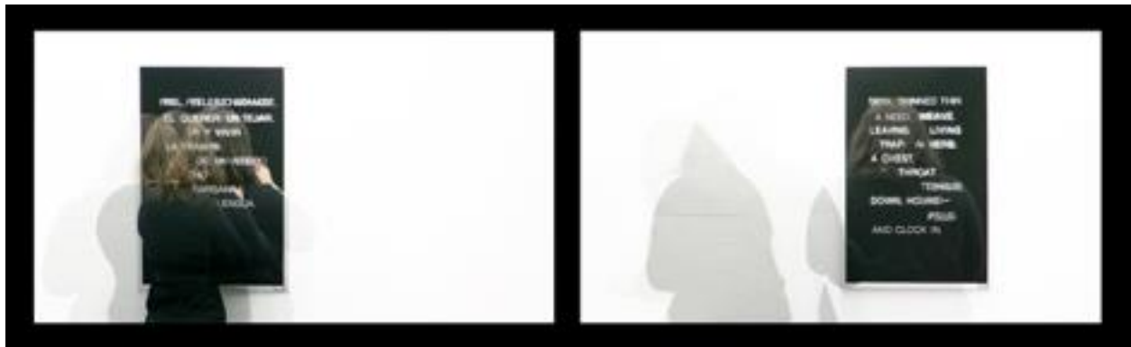
Figure 7: By Author, stills from VERB/O , 2014

En USA, or Women Looking South: Anthology of South American Poets in the US. This writing conveyed how I felt in relation to my current immigration status. It speaks to the ideas of forming connections and belonging in a country I cannot quite call my own. The translation into English is figurative because a perfect or exact translation, particularly in the form of concrete poetry, can never be achieved. Because of this, the length and placement of the words in the board differ, degrading the synchronization of the videos.