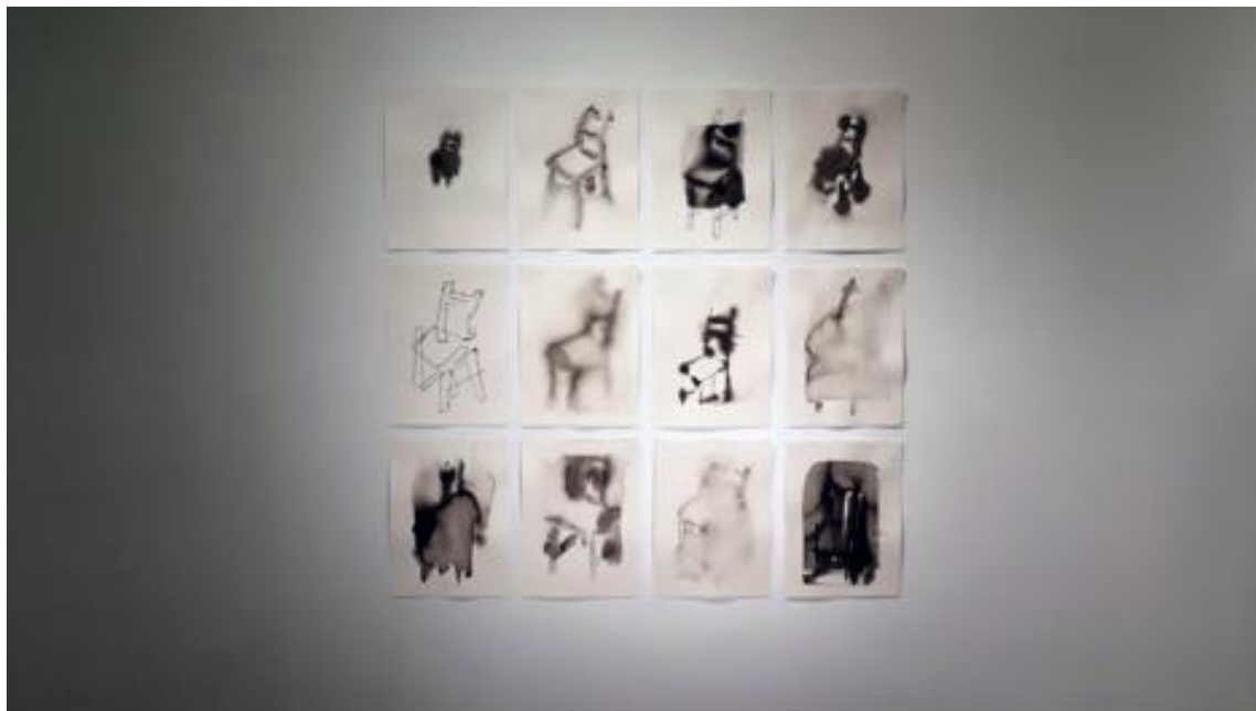
Figure 5: By Author, 12 Chairs , 2015, 36" x 40"

instinct to replicate the lines and textures before me. Because I altered the order of washes, brush strokes, and mark making, I was unable to control how the water and pigment would dry on the surface—emphasizing the unpredictability of the media and its relation to the metaphor of the chair. My use of black ink made the mark making decisions seem much more important. These drawings echo my Impression series, as they became proof of concept.