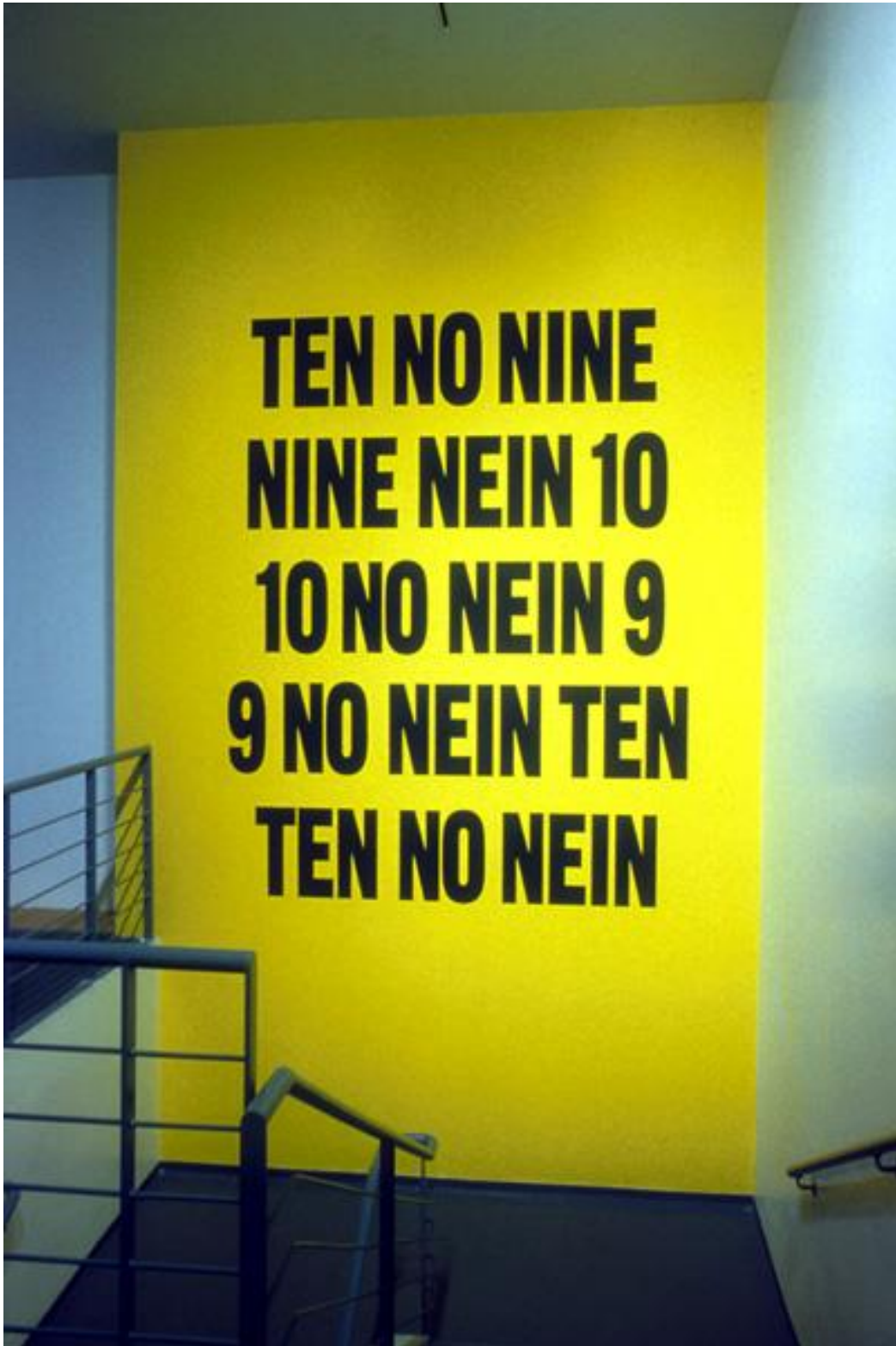
Figure 2: By Kay Rosen, 9/10 , Los Angeles Museum of Contemporary Art, 1993