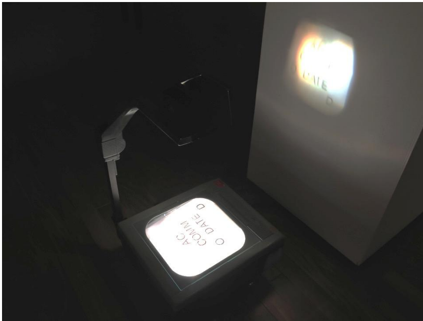
Figure 10: By Author, accommodated , projector, projection, and plastic letters, 2016

In the piece accommodated , an overhead projector with loose plastic letters sitting on the glass surface, I illustrate my perception to my own artistic process: it adjusts, it adapts. It is always shifting. The variety of processes within my artworks converges with my personal experiences as an immigrant: they are consistent in their ever-changing nature.