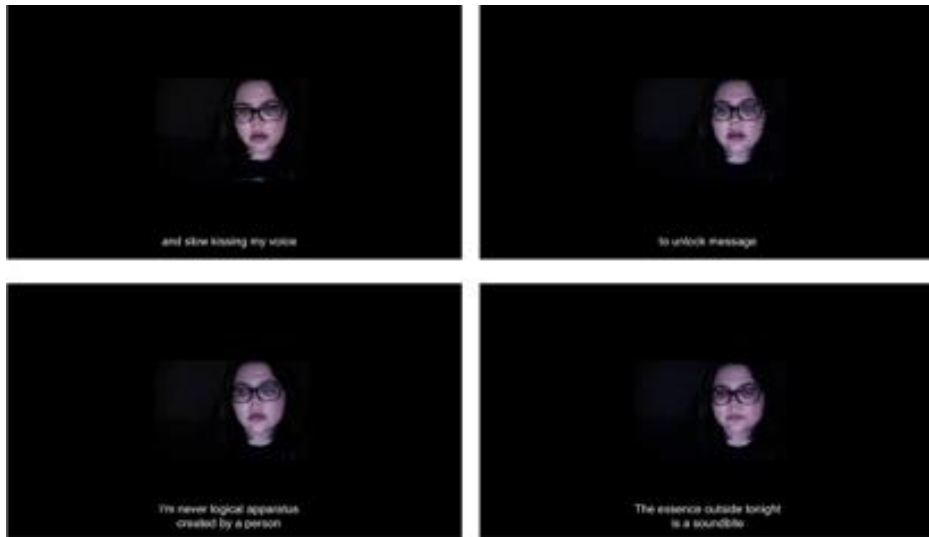
Figure 9: By Author, stills from Better view in a Galaxy on , 2015