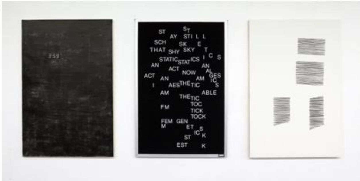
Figure 4: By Author, 3:59 ( Static Noise ), 2015, 36" x 72"

In 3:59 ( Static Noise ), I set opposites against each other. Because of my fascination with video and sound as concepts, I wanted to interpret the word static and its opposite meanings. Static refers to the lack of movement as well as to the sound and visual qualities of a malfunctioning radio or television. Both meanings also characterize agitation in my thoughts and perceptions. The triptych format speaks to the idea of rhythms, both in form and content. Immediacy is invoked by the word sequences within the letter board composition consisting of repeating sounds and word combinations. Word choices referring to markers of time allude to motion. Words dissolve into (visual) sounds and, ultimately, into single letters. Although no actual sound component is present in the piece, my intent was for the viewer to perceive sound through the different visual rhythms in the composition.