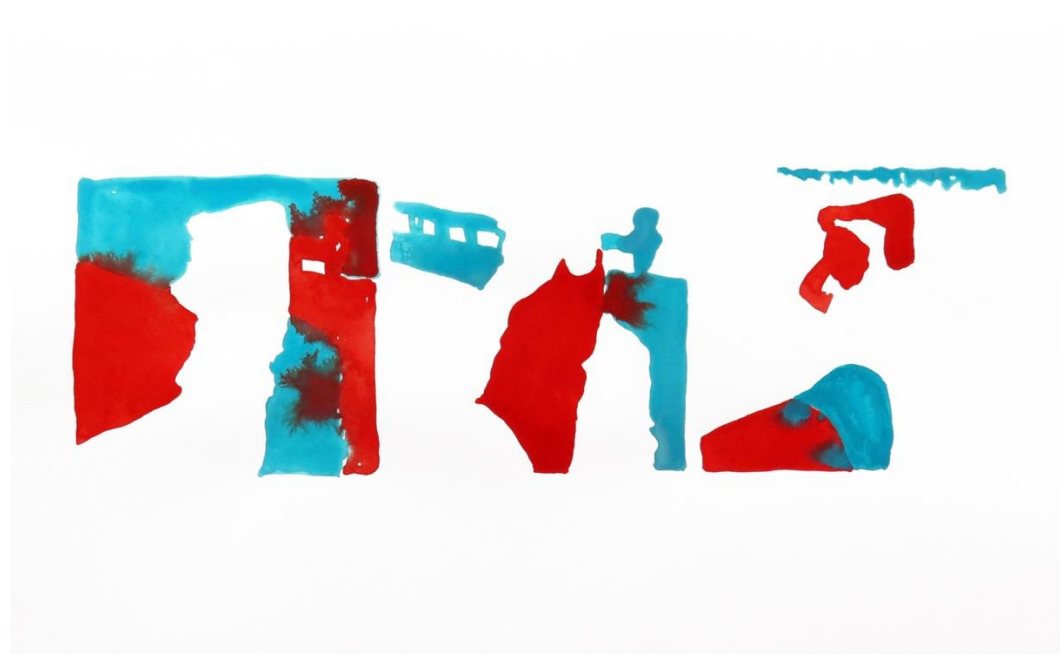
Figure 1: By Author, Impression series (Blue and Red) , 2014, 13" x 8"