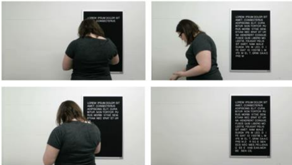
Figure 6: By Author, stills from FPO (Lorem Ipsum) , 2014

evident that the video has been sped up as I begin writing the first few lines of Lorem Ipsum , or the most common placeholder text in graphic design, on the board. The video, lasting just under three minutes, displays the actions of building the board, which took half an hour in real time. Through the monotonous pace and repetitive actions shown during the course of FPO (Lorem Ipsum) , the futility of writing what is technically nonsense is apparent, and the motives for filming this process are present in the act of writing rather than in the words themselves.