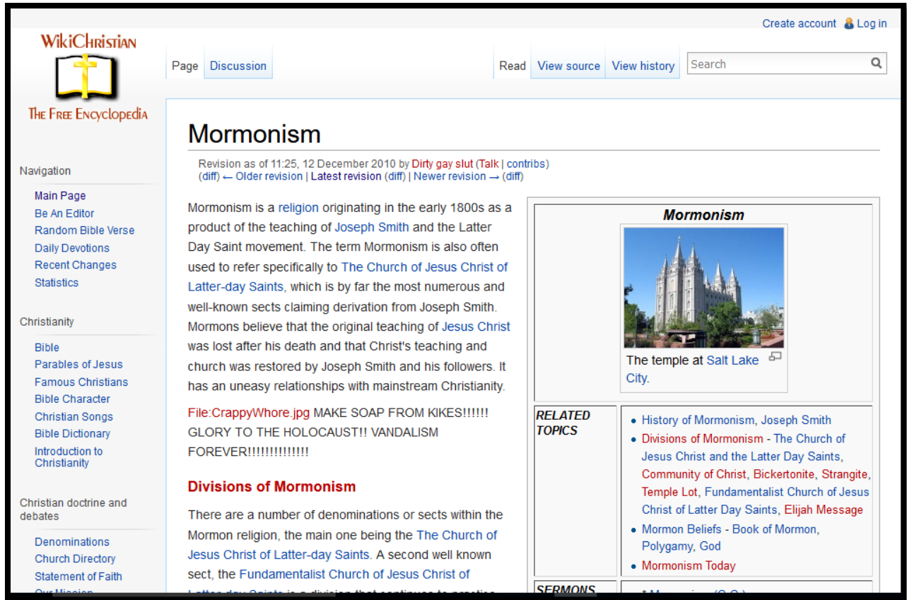
Figure 1: Clip of 12 Dec 2010 Vandalism on WikiChristian