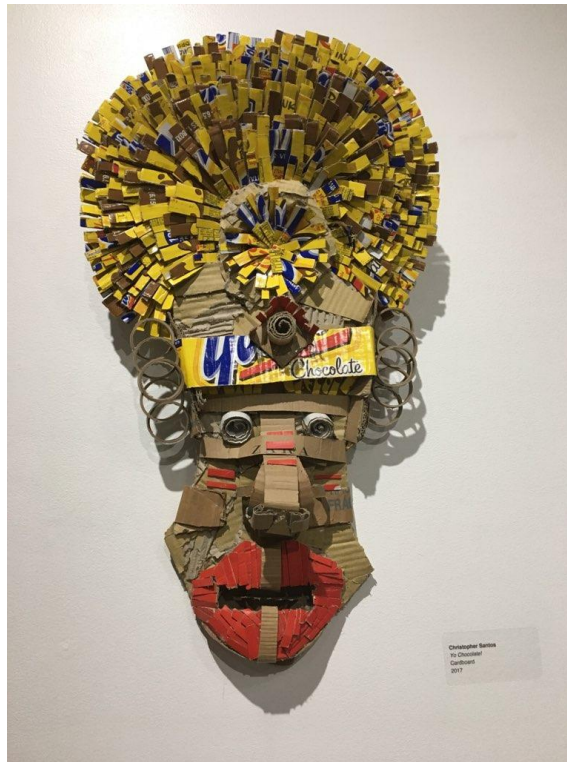
Figure 10: By Author, "Yo! Chocolate!", 2018, (Cardboard)

single items in multiples he sets up a critique of American consumer culture. My work continues the critique that Cole sets up by making work out of the byproduct of consumerism - the is cardboard packaging. I make art out of repurposed materials as well. My sculptures are made of all the same materials and I do not add a finish on it to stay true to the material.