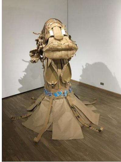
Figure 14: By Author, "Jemima" 2018, (Cardboard)

This piece is entitled Jemima and she is modeled after the mammy archetype. I take inspiration from West African Motifs and intertwine them with American racial stereotypes and archetypes to create my sculptures. I want to create a dialog for understanding the past, so we can begin to better comprehend one another in the future.