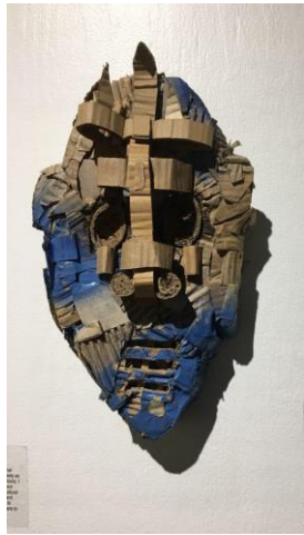
Figure 8: By Author Mask 1, 2018 (Cardboard, Spray paint)

our consumerist society, this trash material is repurposed into art through my practice. The cardboard material spoke to me and took on a personality of its own, the textures of the boxes revealed something to me. It was a natural progression from craft paper. It started with ink drawing renditions of African masks on craft paper and then eventually they transformed into 3D masks.