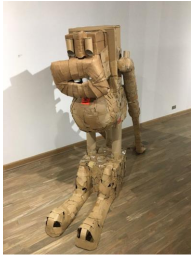
Figure 13: By Author, "Othello" 2018, (Cardboard)

grinning smile is based on the notion that Sambo is a happy, carefree, slave who loves his place on the plantation.