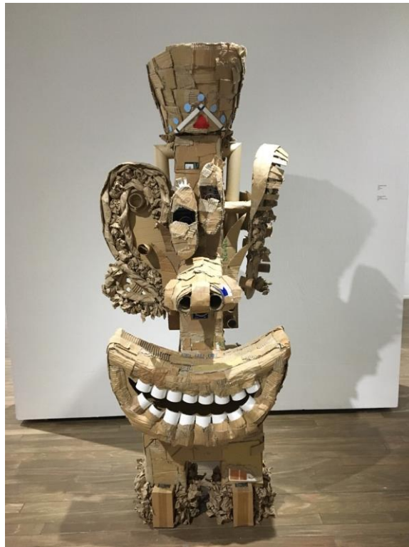
Figure 12: By Author, “Sam” 2018, (Cardboard)

qualities” (Murrell 2008). While Oxford Reference defines cultural appropriation as, “A term used to describe the taking over of creative or artistic forms, themes, or practices by one cultural group from another. It is in general used to describe Western appropriations of non-Western or non-white forms and carries connotations of exploitation and dominance” (2017). According to this definition Pablo Picasso, Henri Matisse, and their peers are guilty of cultural appropriation; the creation and advancement of the cubist movement was erected from the works of African artists who were never credited.