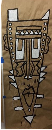
Figure 7: By Author, Untitled (from Mask Drawing Series) 2017

This mask drawing is inspired by the Bambara antelope mask. The Bambara are one of the largest tribes living in Mali, numbering at about one million. This mask belongs to a group of animal masks representing an antelope. It is associated with the Kore society of The Bambara people.