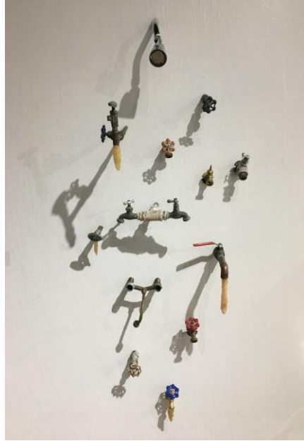
Figure 2: By Author, "Lead Water" 2016, (Pipes and Faucets)

From this water crisis I was inspired to create " Flint " and " Lead Water ". " Flint " is an installation of a sink and mirror like one would find in any ordinary house, but the sink is filled with orange water to mimic the color of lead poisoned water. " Lead Water " is an installation of pipes and faucets. These faucets are a combination of both outdoor and indoor faucets and pipes to better widen the scope of how badly the area was affected.