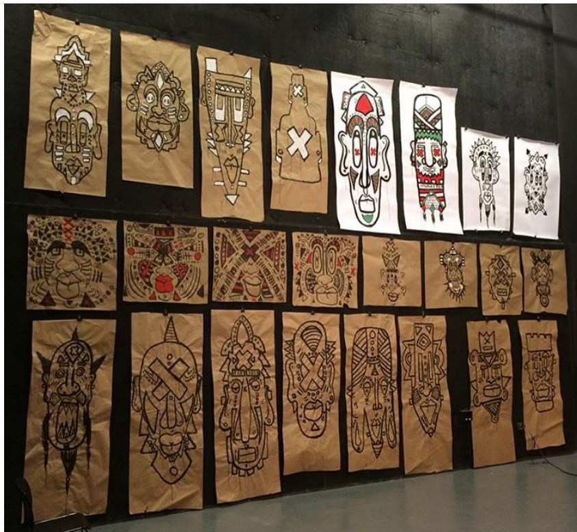
Figure 5: By Author, Mask Drawing Series, 2017 (India Ink, Acrylic, Craft paper)

Inspired by the artifacts in my house, I chose to address them in the art. These drawings are an adaptation of traditional African masks and American cartoon styles. Researching how black bodies are represented in cartoons I began incorporating specific characteristics, such as the symbols for lips and noses, into each mask with a West African motif as the base to build on.