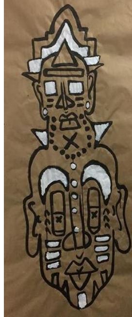
Figure 6: By Author, Untitled (from Mask Drawing Series) 2017

I was inspired by masks from various African tribes, from the Bangangte people in the western part of the Cameroons grasslands to the Ibibio people of Nigeria.