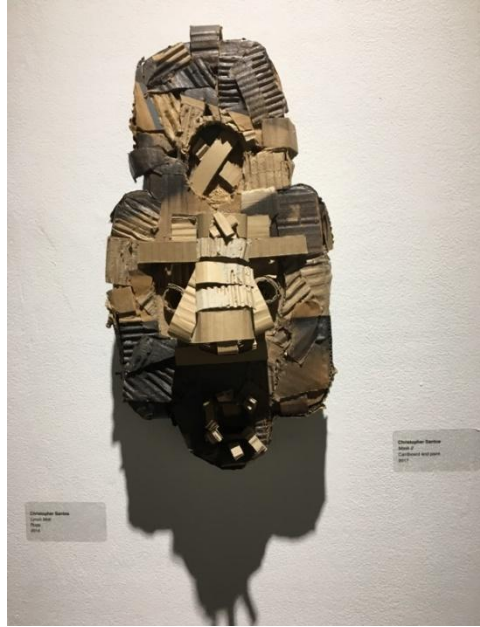
Figure 9: by Author Mask 2, 2018 (Cardboard, Spray paint)

The reference for Mask 2 is another mask from the Ibibio people of Nigeria. This mask has a detachable jaw that is fastened in place with leather strips. Still highlighting the facial features of the Ibibio mask, I use the eyes and nose as reference.