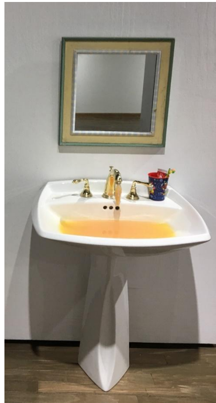
Figure 1: By Author, "Flint", 2016, (Sink)