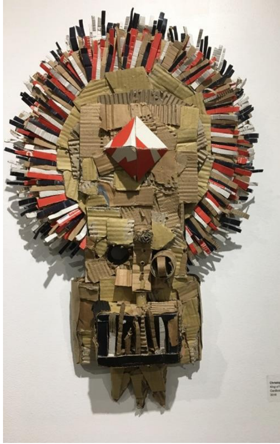
Figure 11: By Author, "King of No Nation", 2018, (Cardboard)

"King of No Nation" is made from cardboard and two shoe boxes. I made the head piece from a Nike shoe box and a dress shoe box. "King of No Nation" was very much a reflection of self. A self-proclaimed king who does not fully belong anywhere. It also alludes to the notion of code switching, the ability to change one's persona and demeanor to advance oneself in a workplace or community.