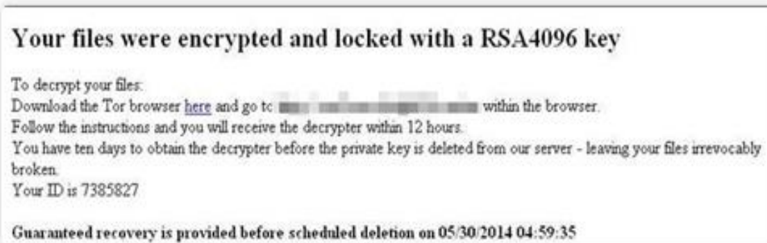
Figure 2. Ransomware – LOCKY.

Two very common and fast-spreading ransomwares are the WannaCry and the LOCKY. These ransomwares spread typically via attachments to emails often as a JavaScript-file. They can also be spread through executable files. Once the attachment is accessed, the JavaScript runs a program that encrypts all files on the user's computer including those on network drives, removes the originals and deletes any system restore point so that the machine can never be reverted to an earlier state. It then creates a desktop message (as shown in Figure 2) that asks the user to pay the ransom using bitcoins via a TOR browser (Furnell & Emm, 2017).